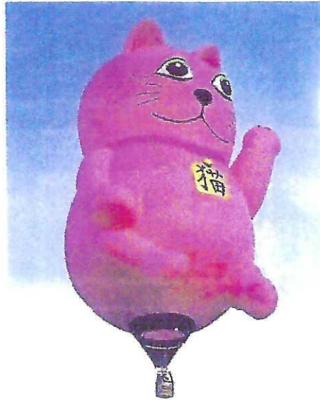
High Kitty has appeared at the QuickChek New Jersey Festival of Ballooning.

The annual summertime event, which draws more than 150,000 people to Solberg airport the last weekend in July, has seen its fair share of firsts - big-name concerts, one-of-a-kind