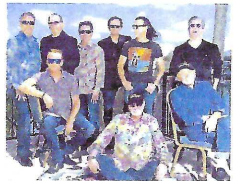
The Beach Boys are headlining this year's QuickChek New Jersey Festival of Ballooning.