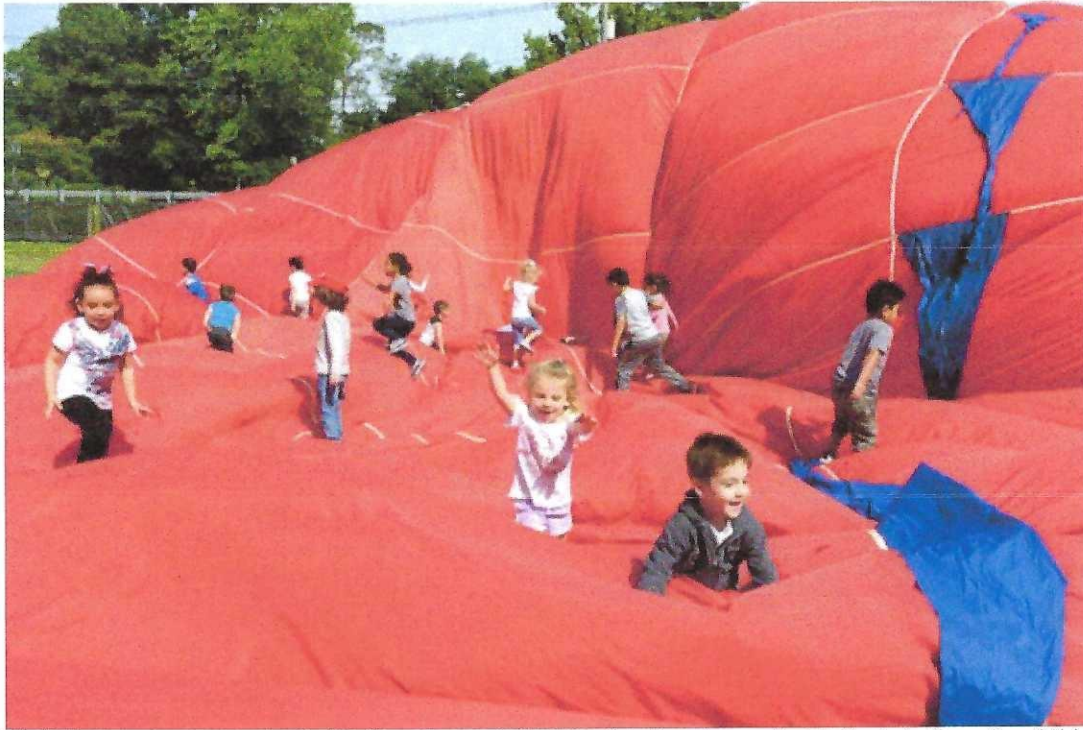
The QuickChek New Jersey Festival of Ballooning and PNC Bank inflated a 75-foot-tall air balloon for children in the Wayne Center for Family Resources to play in on Wednesday, June 12, 2019. The children help deflate the balloon.

The hot-air balloon, which is no longer used to fly has been touring preschools in New Jersey and is used in PNC's "Grow Up Great" bilingual early education program.