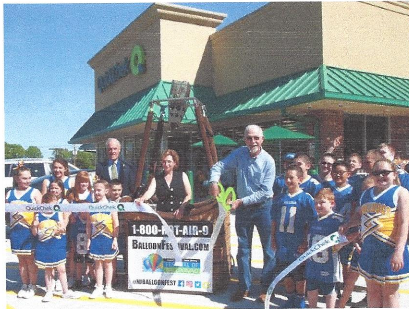
Tickets for the 36 th annual QuickChek New Jersey Festival of Ballooning go on Sale May 25.

READINGTON - Memorial Day Weekend launches the beginning of summer — and it launches balloons, too.